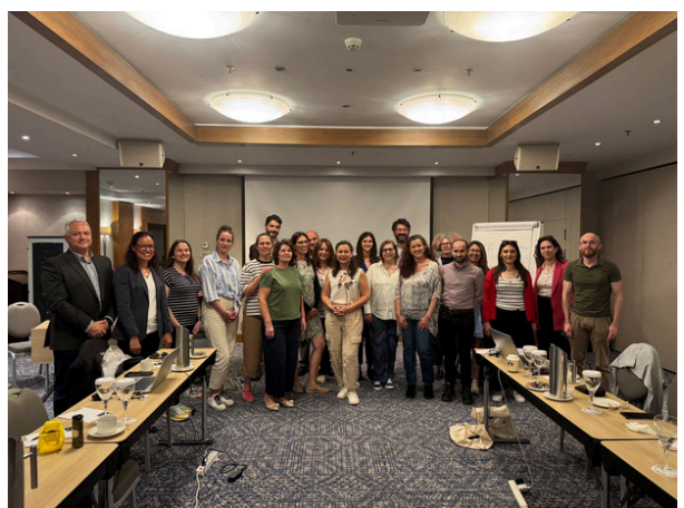
ReMED partners in Fyli during meetings and site visit