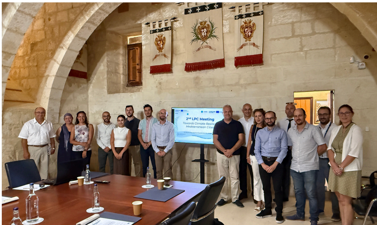
Participants in Malta and Gozo's 2 nd LPC meeting in Gozo

The meeting concluded with an interactive exchange, where attendees offered feedback on methodologies, indicators, and the envisioned modular training system, reinforcing the collaborative efforts toward developing tools suited to Gozo's specific needs and context.