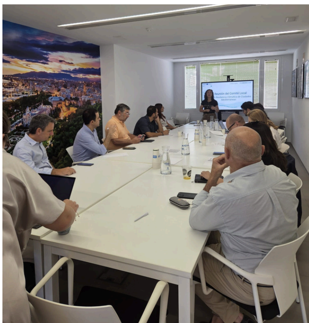
2nd LPC for Spanish partners at CIEDES

Through collaborative working tables, the local committee members engaged in dynamic discussions to analyze and strengthen Málaga's urban resilience against climate change. This workshop marks a significant step in building a coordinated, city-wide approach to a more sustainable and adaptive future.