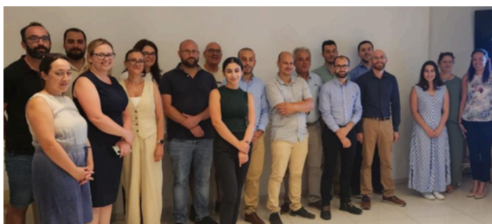
Group photos from 3 of 4 LPC Meetings held in Malta/GoZo (top), Spain (bottom) and Greece (left)