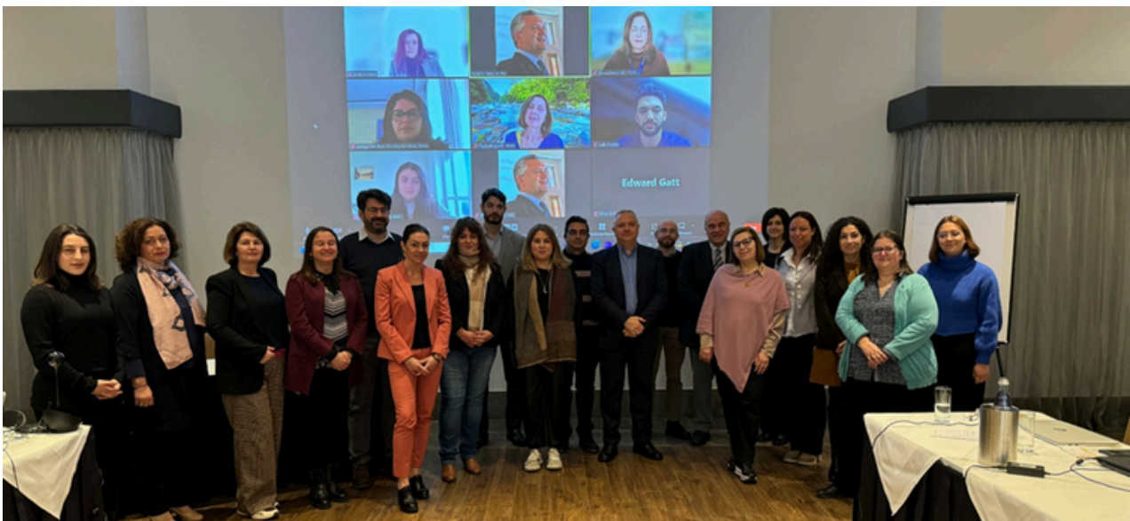
Members representing all Partners present for ReMED Kick-Off meeting in Malta