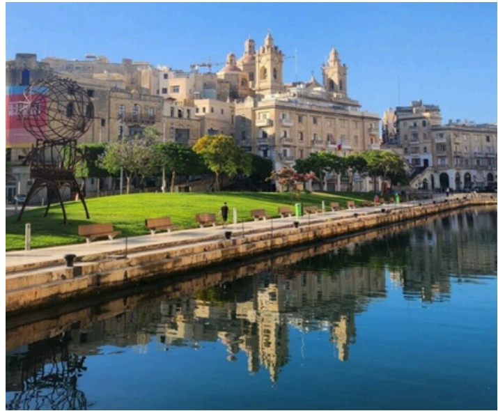
Image of Dock 1 in Cospicua (Bormla), Malta was voted by the ReMED Partners to represent the rationale of the project.

The City is an example of regeneration and gentrification over the past decades shifting from heavy port industry, to open spaces that welcome dynamic social interactions with the historic dock area.