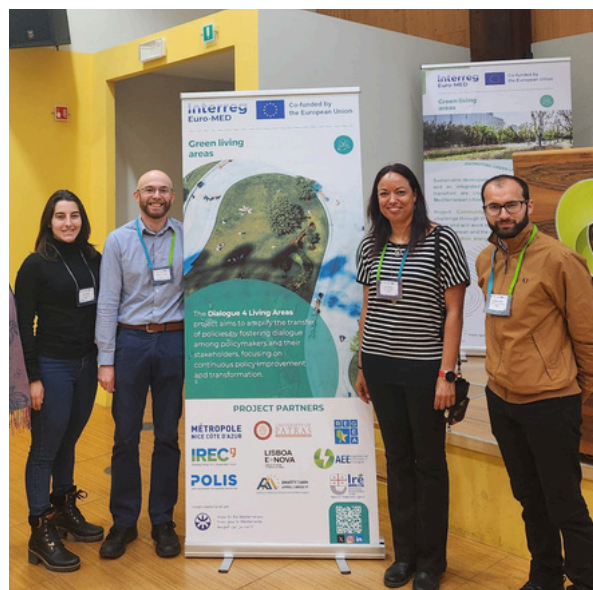
Delegation from University of Malta and EcoGoZo